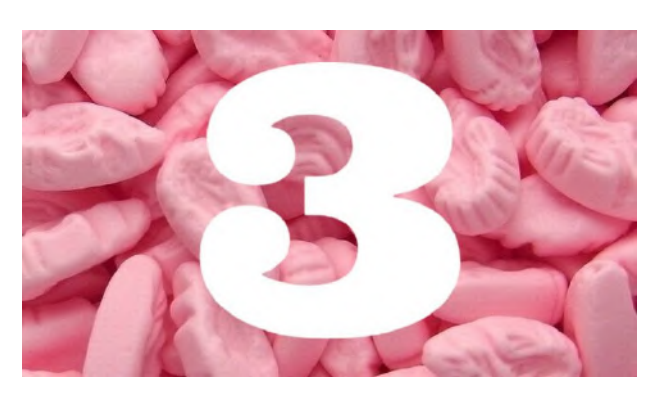
Dip into Drama (PS1)