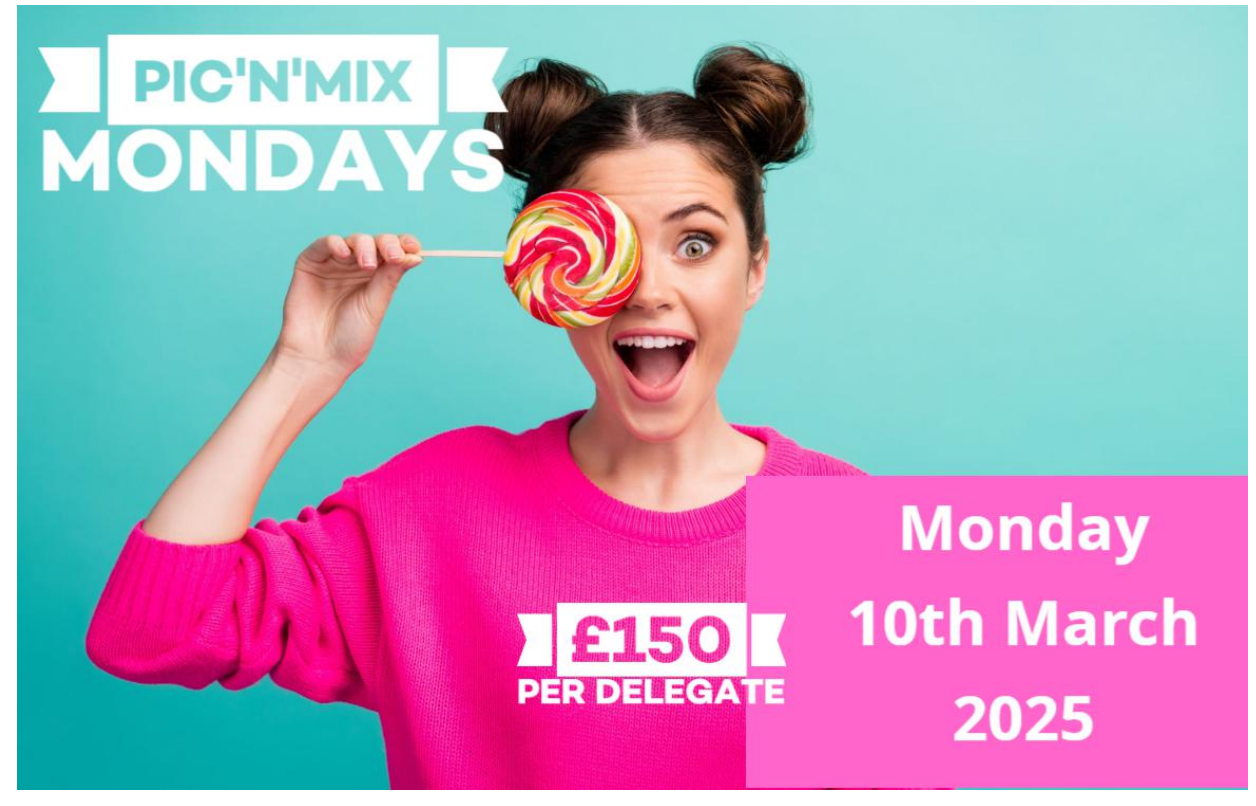
Choose 2 workshops for each delegate: