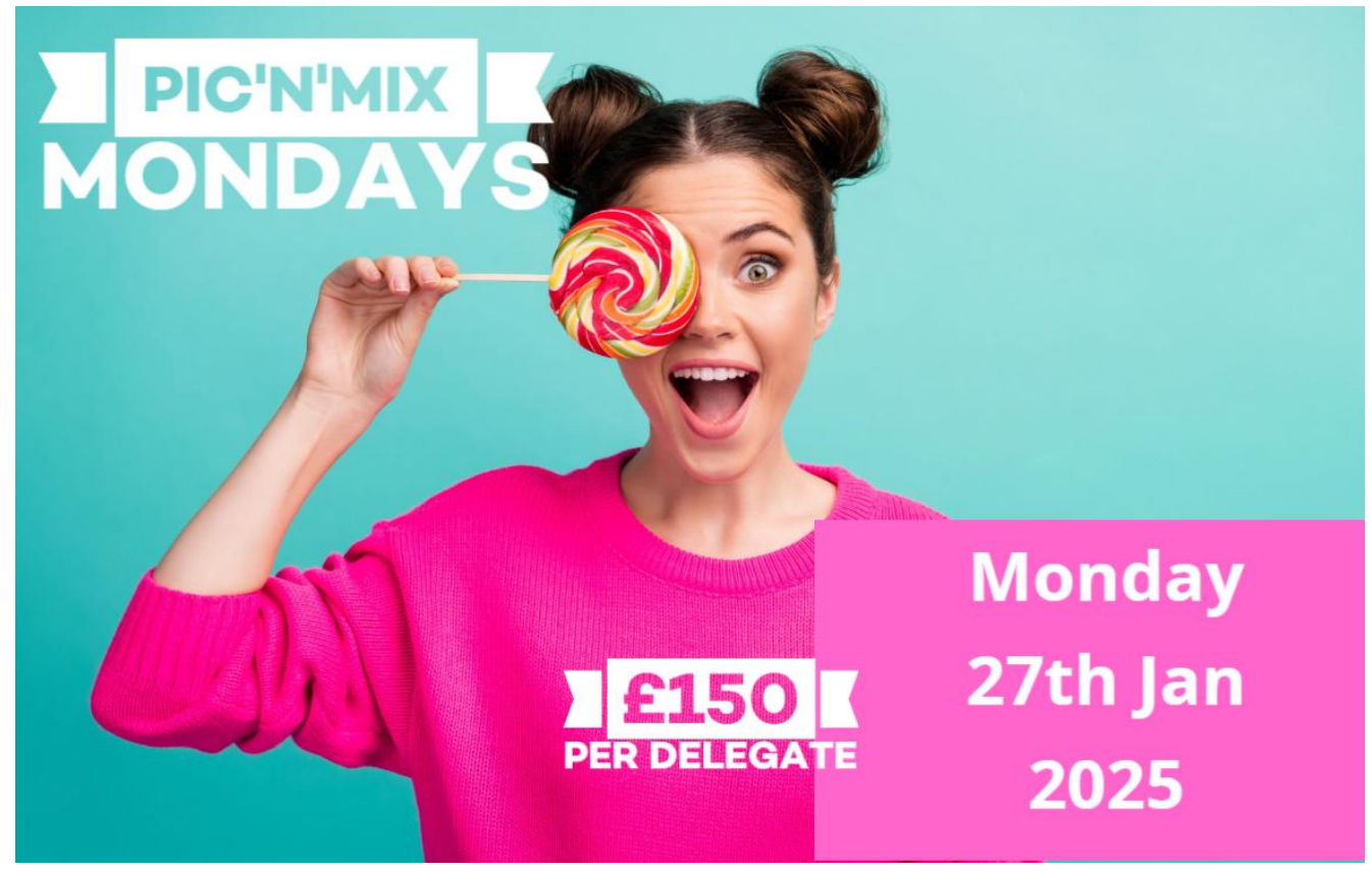
Choose 2 workshops for each delegate: