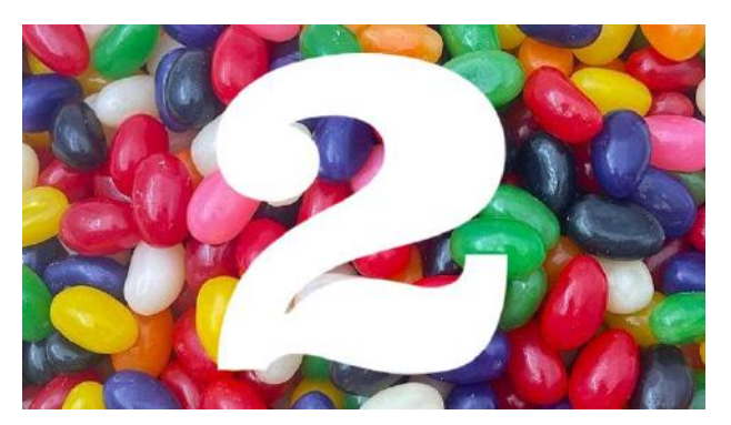
Improving Handwriting across the Primary School - From Policy to Practice

Practical strategies and workshop based activities will bring theory and practice together to identify possible reasons as to why learning becomes challenging in mainstream classrooms.