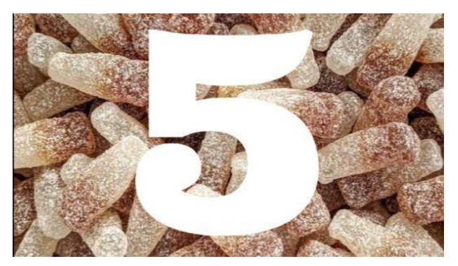
Maximising my Impact as a TA